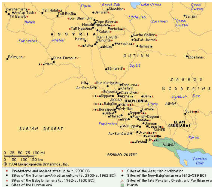
Map of Mesopotamia Showing Positions for Eridu, Ur, Uruk, Lagash, Umma, Adab, Isin, Nippur, Kish, Sippar, Akshak, Mari, Awan (as a region), and Hamazi

A complete understanding of the Teutons is not possible without placing them in the context of this First Kish order and then describing at least in outline what became of them from that time until they entered Europe. For example, were they present at the Battle of Teutates in 2178? Like other members of the Centum Aryan stock, they descended from the union of Ham with the White Matriarch Uma. Each of the diluvian survivors generated two stocks making up a total of sixteen by the Eanna period. The Teutons shared Mahadevi's city Lagash with one of her two stocks, the Amerindians. This casual association left at least one detailed mark on the two races. Two of the remarkable sequence of tribes in Ptolemy's map of Germany, the Omani and Quadi, took the names of two patriarchs in the same form as these two persons named as gods of the native South Americans, Oman and Kuat, Heth and his father Canaan, the Lagashites Ur Nanshe and his father Gunidu.