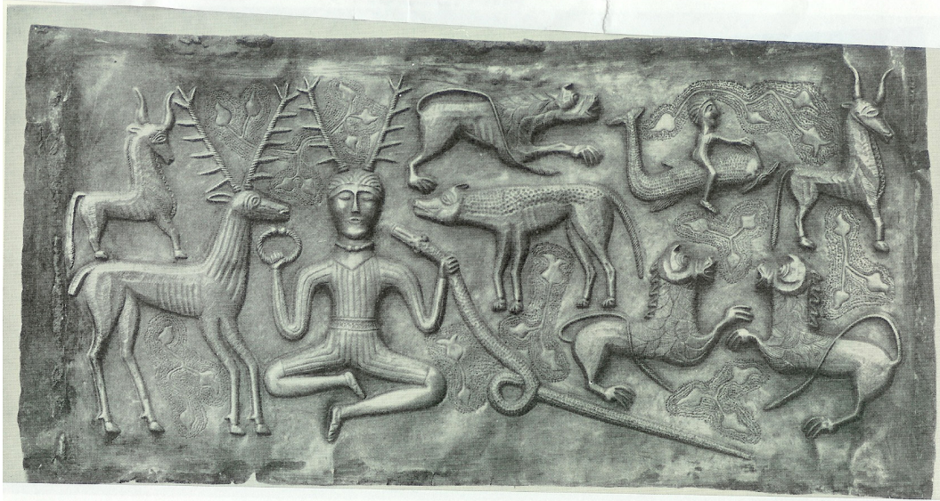
Cernunnus Panel of the Gundestrup Caldron

Interpretive Code (for Indo-Europeans only): First Kish Order 2338-2308 BCE